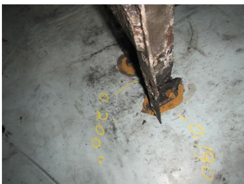
Pitting on Shell