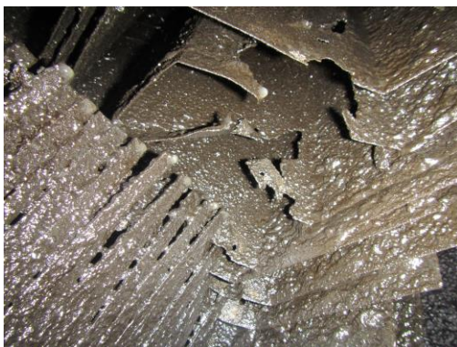
Vein Pack Corrosion