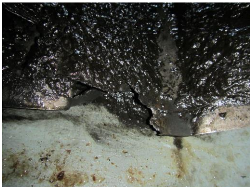
Vein Pack resting on floor