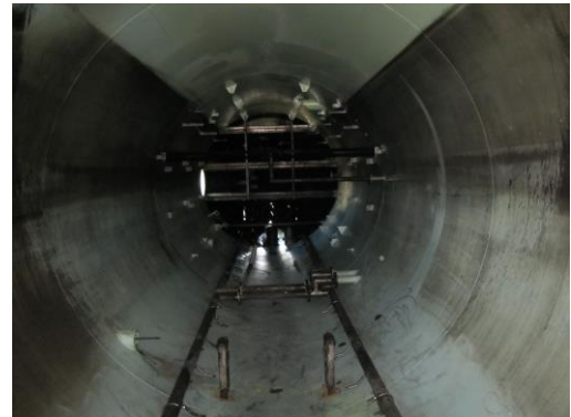
Overall Internal View