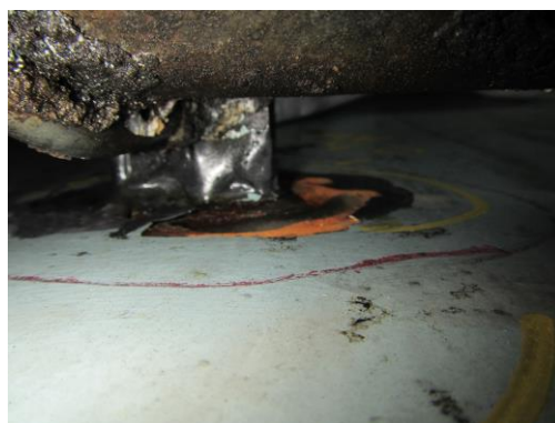
Pitting on Bottom of Shell