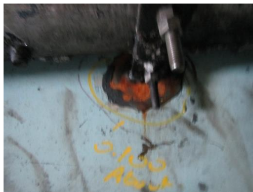
Pitting on Shell