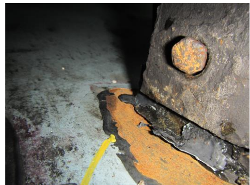
0.200" Corrosion on Anode Bracket